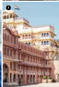
PURE JAIPUR Clockwise from top: 1. A view of Jaipur from Nahargarh Fort; 2. Showing off a bridal necklace of diamonds and pearls at Gem Palace, one of the city's iconic jewelry institutions; 3. Jaipur's City Palace; 4. Carrying flowers at Phool Mandi; 5. Arranging a table-setting at Rajmahal Palace; 6. Bar Palladio, a bar with dramatic East-meets-West interiors.