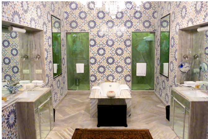
Bath in The Maharaja's Apartment at SUJÁN Rajmahal Palace in Jaipur, India