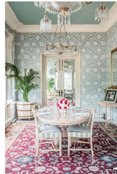
Framed photographs of the royal couple sit serendipitously on the mantelpiece and it comes with its own grand dining room, which is the perfect spot to take breakfast room service.