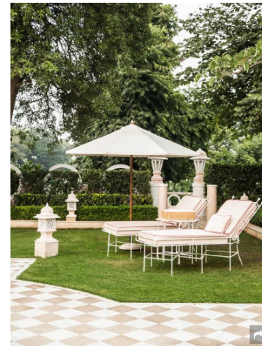
Sitting on plush grounds that are perfect for a spot of croquet and afternoon tea, Rajmahal Palace has a Wes Anderson aesthetic down to a tee.