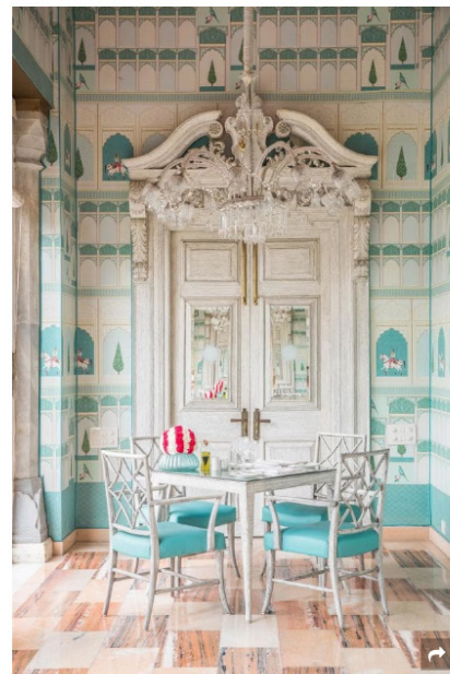
Owned by the royal family in Jaipur, this palace isn’t afraid of colour.

One of India’s most Instagrammable hotels, Rajmahal Palace is a quirky boutique hotel that has played host to royals and celebrities alike.