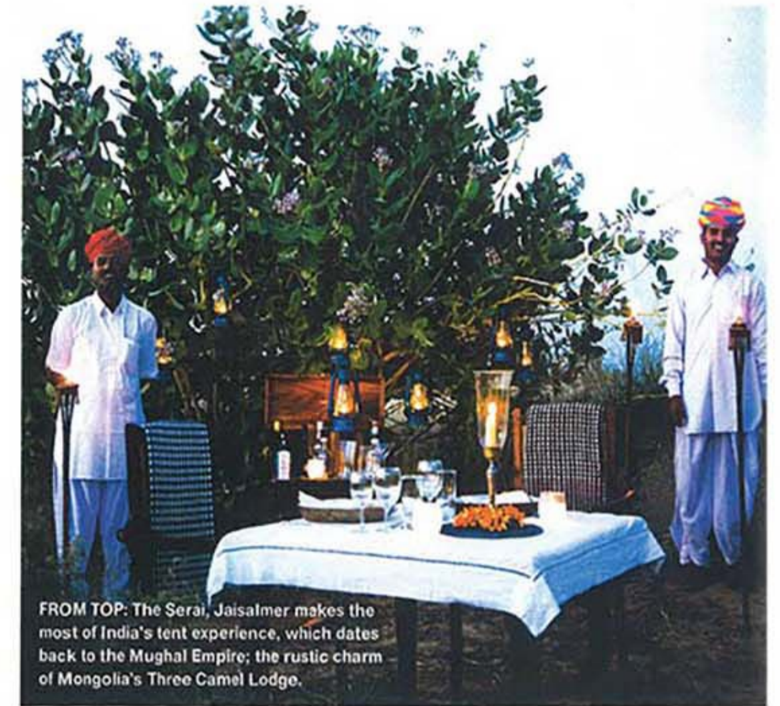
FROM TOP: The Serai, Jaisalmer makes the most of India's tent experience, which dates back to the Mughal Empire; the rustic charm of Mongolia's Three Camel Lodge.