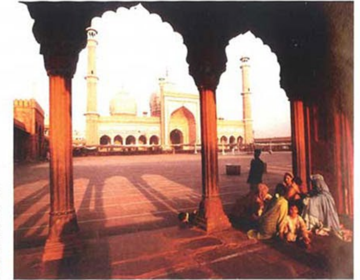
Above: Jama Masjid Mosque in Delhi. Below: guests of the Mihar Gahr, Rajasthan, taking part in a riding safari on Marwari horses.