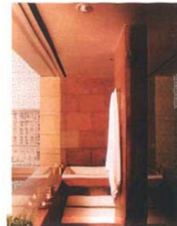
Above: a bathroom with plunge pool at the Aman New Delhi. Below: a 1928 Mercedes Type K Sports Tourer, on show at the Cartier International event at the Turf Club, Bombay.

Keep INDIA firmly on your radar this winter: the country has a spate of new hotels suited to both urbanites and those looking for quieter getaways. One of the most anticipated openings is in DELHI next month, when the Aman group ( www.amanresorts.com ; doubles with breakfast from £560) brings its chilled-out vibe to one of the world’s most chaotic but exciting cities. Sightseeing should include the Red