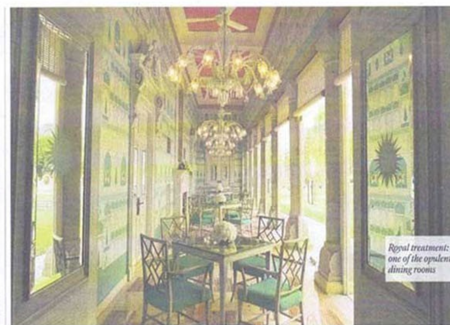
Royal treatment: one of the opulent dining rooms

Outside, an Art Deco pool is surrounded by tranquil gardens and a series of apartments – all