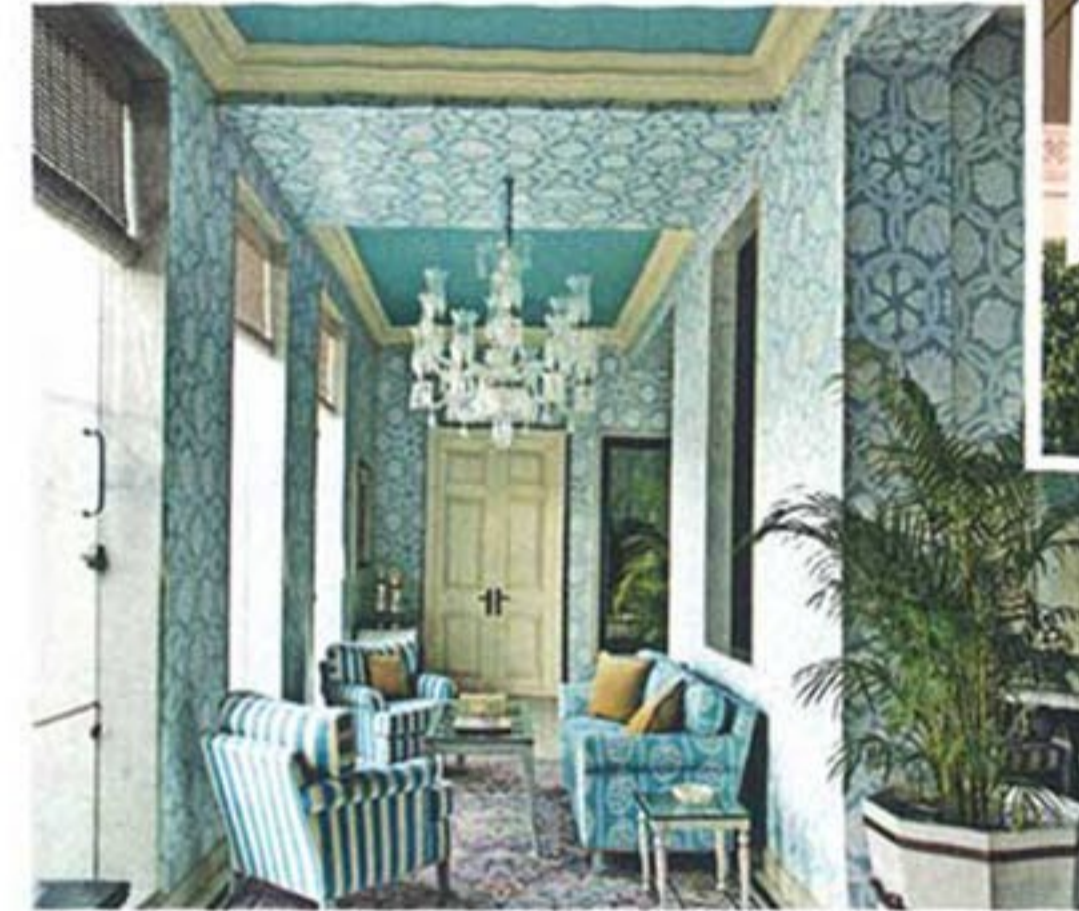
From top: The columned entrance to Jaipur's Suján Rajmahal Palace. The hotel's Mountbatten suite. A drawing room exemplifying decorator Adil Ahmad's spirited elegance.