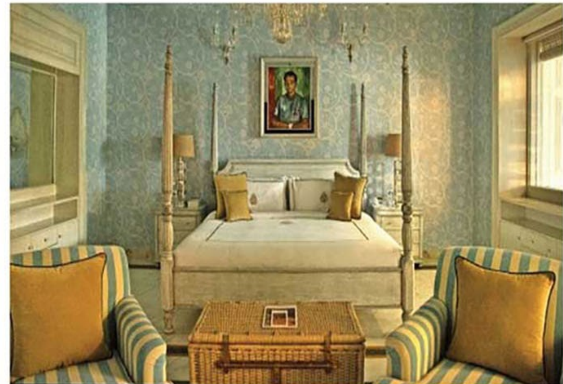
There currently 14 suites on offer at the hotel.

The property has two restaurants, a pool and a spa. From around $330 before tax, including breakfast at introductory rates that apply until April 15. Book through Banyan Tours. See banyantours.com . Email shonali@banyantours.com . See sujanluxury.com .