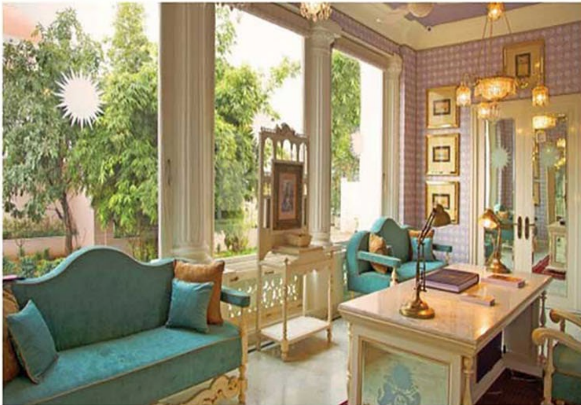
The interior maintains hints of Art Deco, courtesy of a 1930s remodelling.

SHARE Minimalists need not apply – there's nothing restrained about the newly-opened Sujan Rajmahal Palace in India's "Pink City" of Jaipur, Rajasthan. The decor matches its big and colourful history.