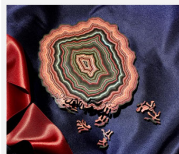
Not Your Average Puzzle