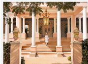
Sleep Like A Raja