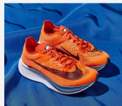
The Rarest Nikes of Them All