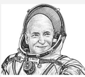
My Favorite Entirely Common Thing